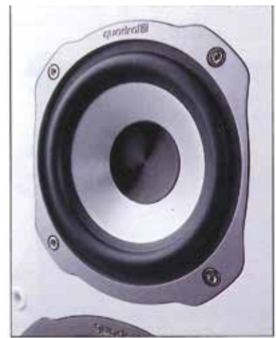
Typical Quadral: Aluminium damped polypropylene membrane for impulsive music reproduction

The price of around 900 euros for a pair of speakers makes the Argentum 490 comparatively inexpensive and it comes with some enhanced technical details as well as attractive workmanship. The 3-way speaker's 1 metre-tall case consists of a white laminated, rectangular MDF case and Quadral also decided to fit a front-plate with a high-gloss finish to enhance the overall visual appearance. In general the Argentum 490 has a superb visual appearance, with the final touch of elegance being provided by the silvery smooth membranes used for the woofer and the mid-ranges.