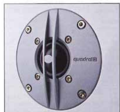
A 25 mm fabric dome has been used to ensure silky high tone reproductions that go way above the auditory threshold

Configuration Two woofers with 130 mm membranes are used in the Argentum 490 to provide the rich bass pressure. Their low resonance, aluminium damped polypropylene membrane based technology is taken from the higher-priced range made by Quadral and they both use a powerful magnetic actuator. Together with the generously dimensioned bass reflex tube fitted at the rear of the case they ensure powerful bass depth and bass pressure without causing any interfering air flow noises. The same membrane material that is used in the woofers has also been used in Quadral's mid-range unit and this pure mid-toner uses a small, 90 mm membrane. The 25 mm fabric tweeter dome has also been updated and the frequency response has been extended downwards so that it can be more harmonically coupled to the mid-tone unit. The developers at Quadral also paid a lot of attention to the expensive frequency separating filter, which was designed using top quality components in order to produce the best sound quality and also to ensure that the Argentum 490 has a well-balanced impedance curve so that the choice of amplifier is no longer critical.